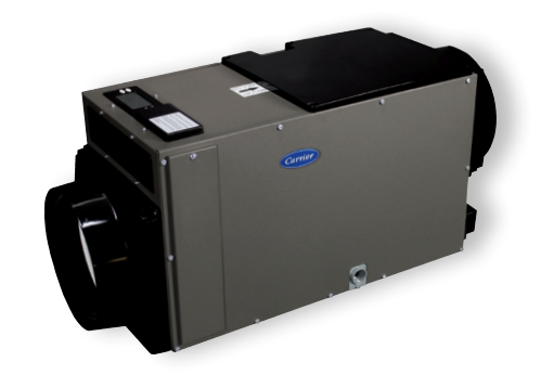
A built-in "clean filter" indicator tells you when it's time to change the filter.

Keeping humidity under wraps can also improve the quality of the air you breathe by keeping mold and some allergens under control.* It can help prevent warping or structural damage to wood flooring or furnishings. And, setting your dehumidification levels is simple and convenient using the LCD control that can remain on the dehumidifier cabinet or installed at a more easily accessed location.