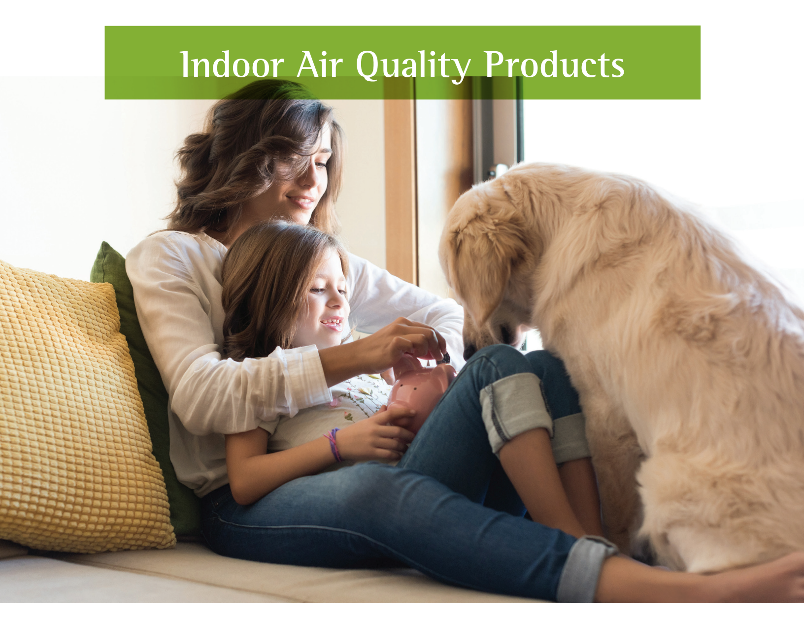
Complete your comfort with cleaner, fresher indoor air